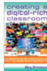
Creating a Digital-Rich Classroom*

* Library edition available. Call 800.733.6786 for details.