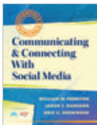
Communicating & Connecting With Social Media*