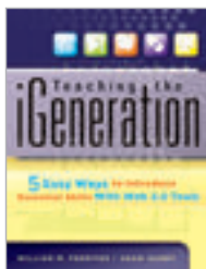
Teaching the iGeneration*