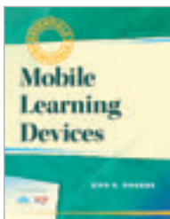
Mobile Learning Devices*